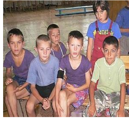
Children at Nizhny Vorota Orphanage